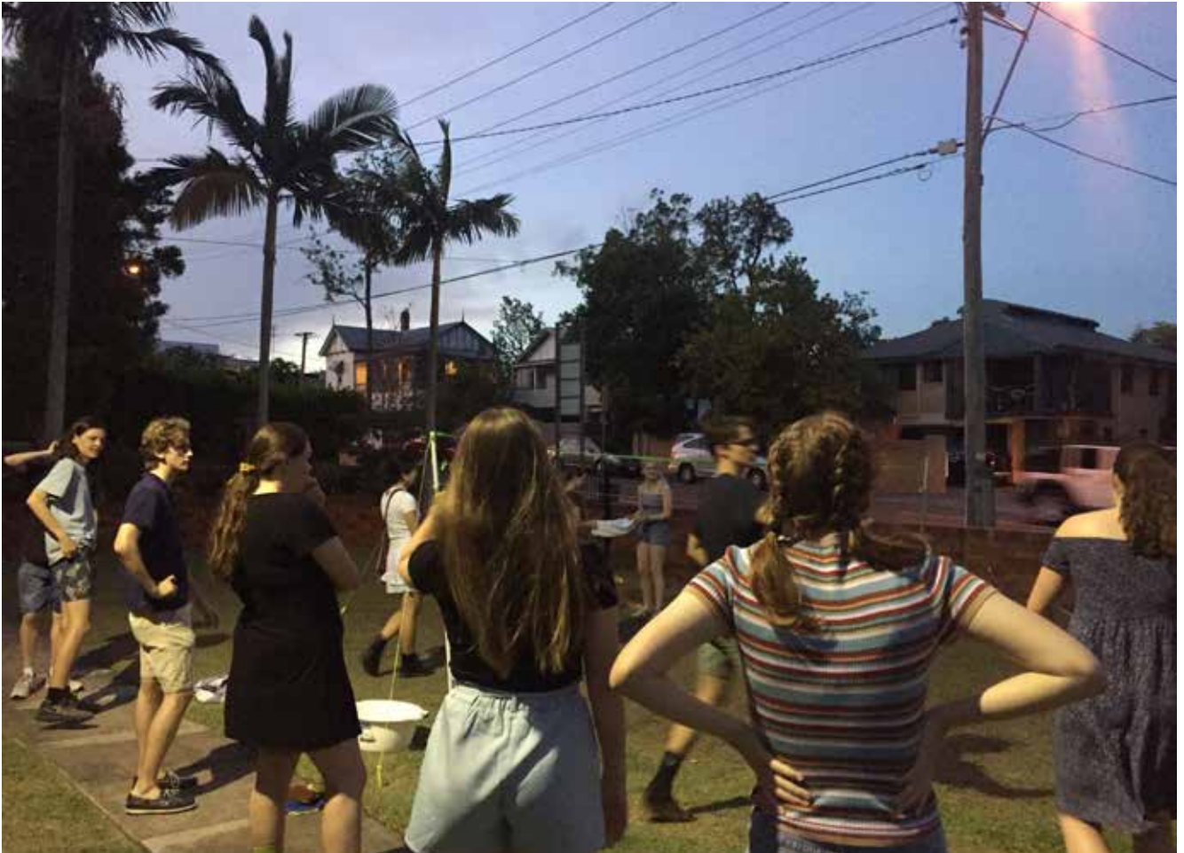
One of the final Senior Youth gatherings in 2020 where the group started off the night with a (competitive!) game of water balloon volley ball.

Our first onsite Playgroup sessions after lockdown were met with tears of joy as we welcomed families back. We were immediately struck with the difficult positions almost all families faced being stuck in Australia during the pandemic unable to see their families at home and anxiously watching infection rates skyrocket in many of those countries.