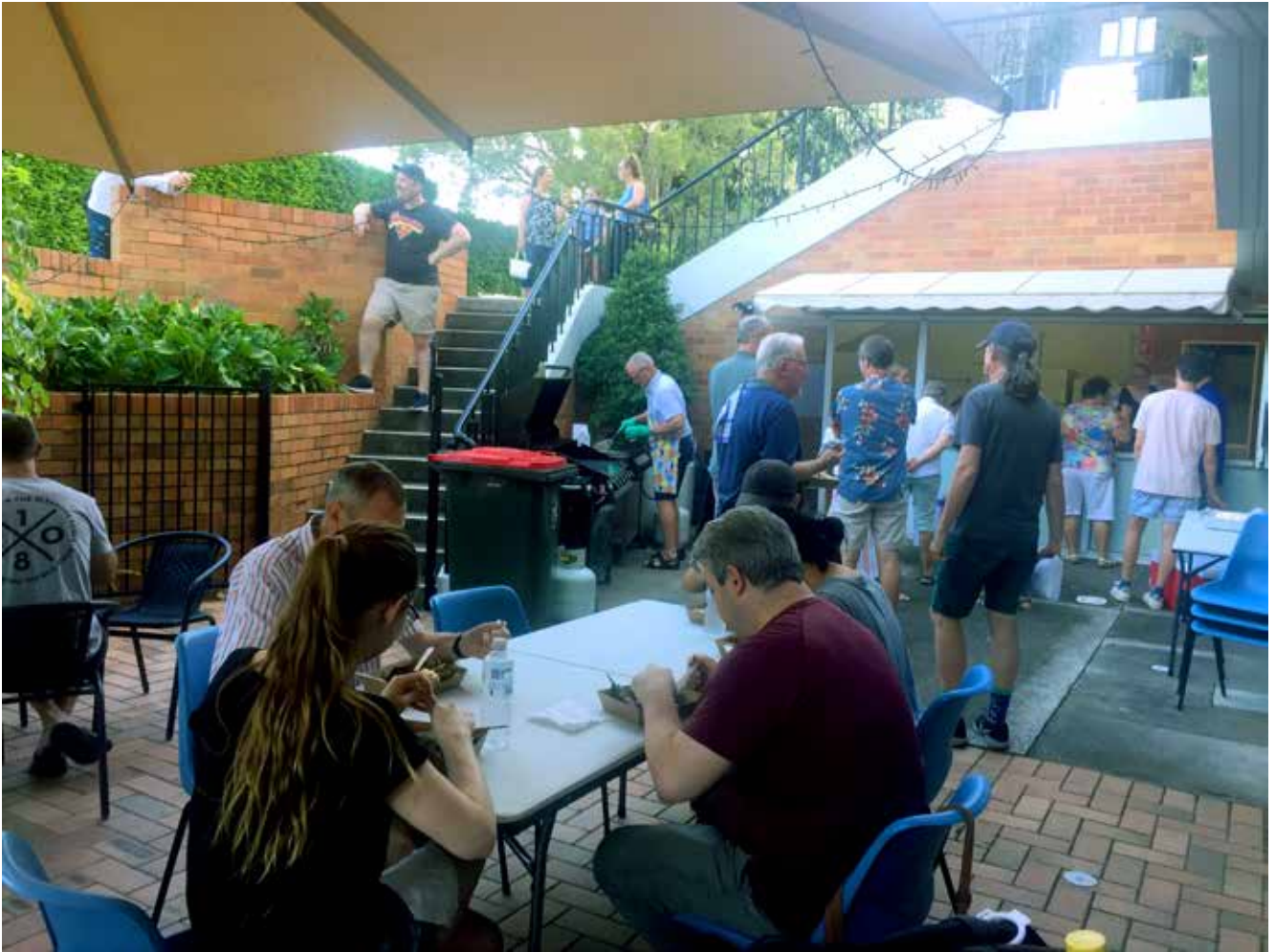
Our Vision & Planning Day on 6 February, 2021. How great it was to plan and pray together for the year and years ahead!