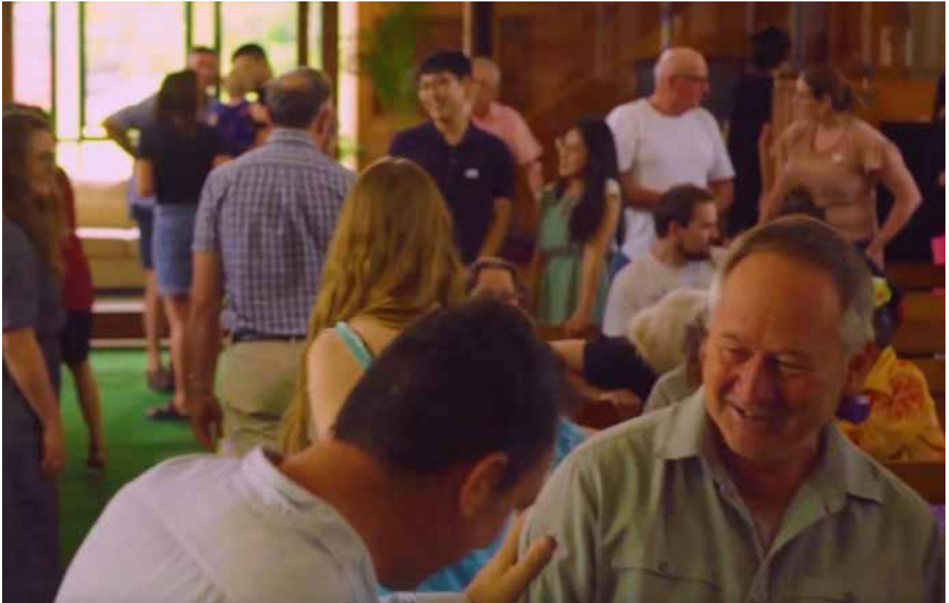
Passing the peace at Sunday worship in early 2020. Little did we know it would only be a few months before we would have to cease in-person worship.

“For I know that my Redeemer lives, and that at the last, He will stand upon the earth. And after my skin has been destroyed, then in my flesh I will see God.”