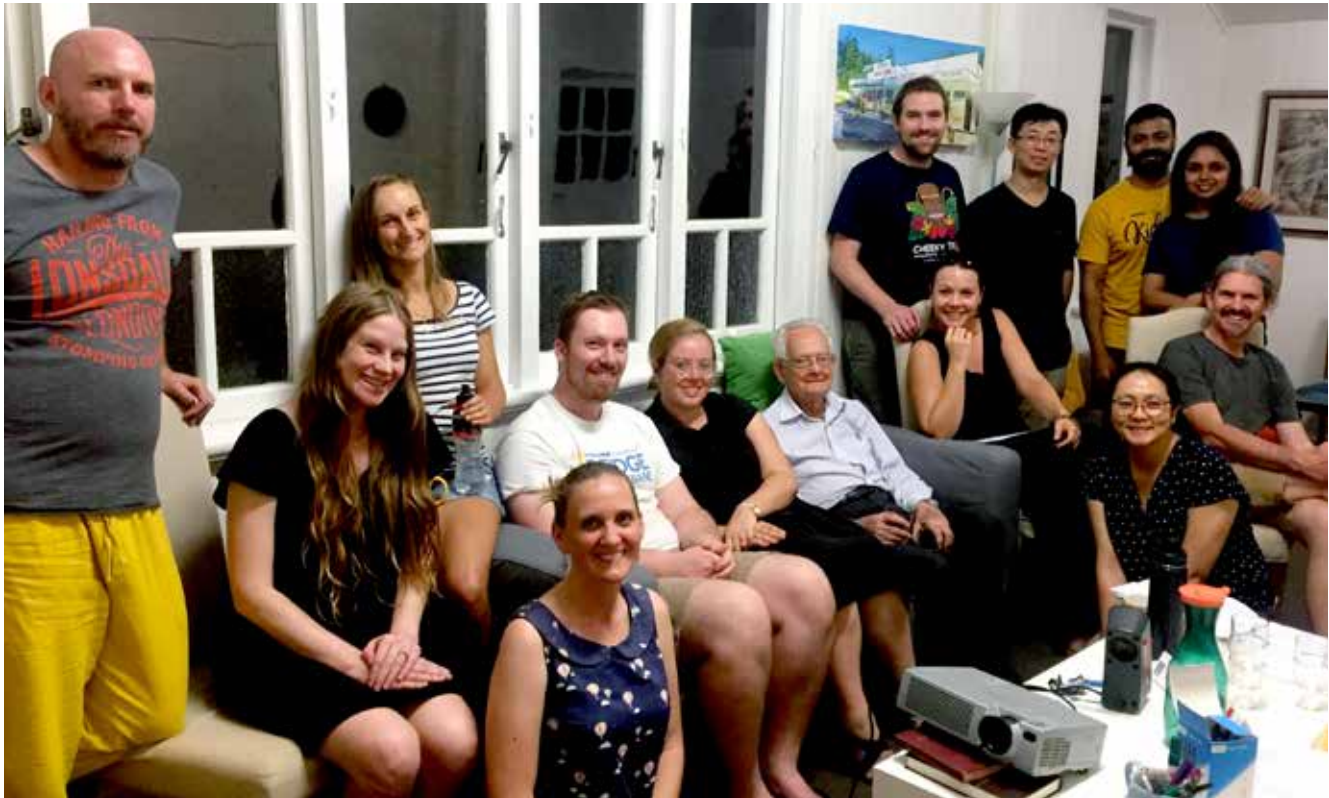
Above is a photo from 18 February, 2020. Little did we know it would be one of the last times we would gather in-person like this for many months!

The Tuesday Pastorate experienced new ways of connecting together over the course of 2020. The year started off as normal, but at the end of March we had to change our plans and meet online via the magic of the internet on a strange new platform called Zoom! However, in Term 3 we were able to meet together in-person once again in the TUC hall.