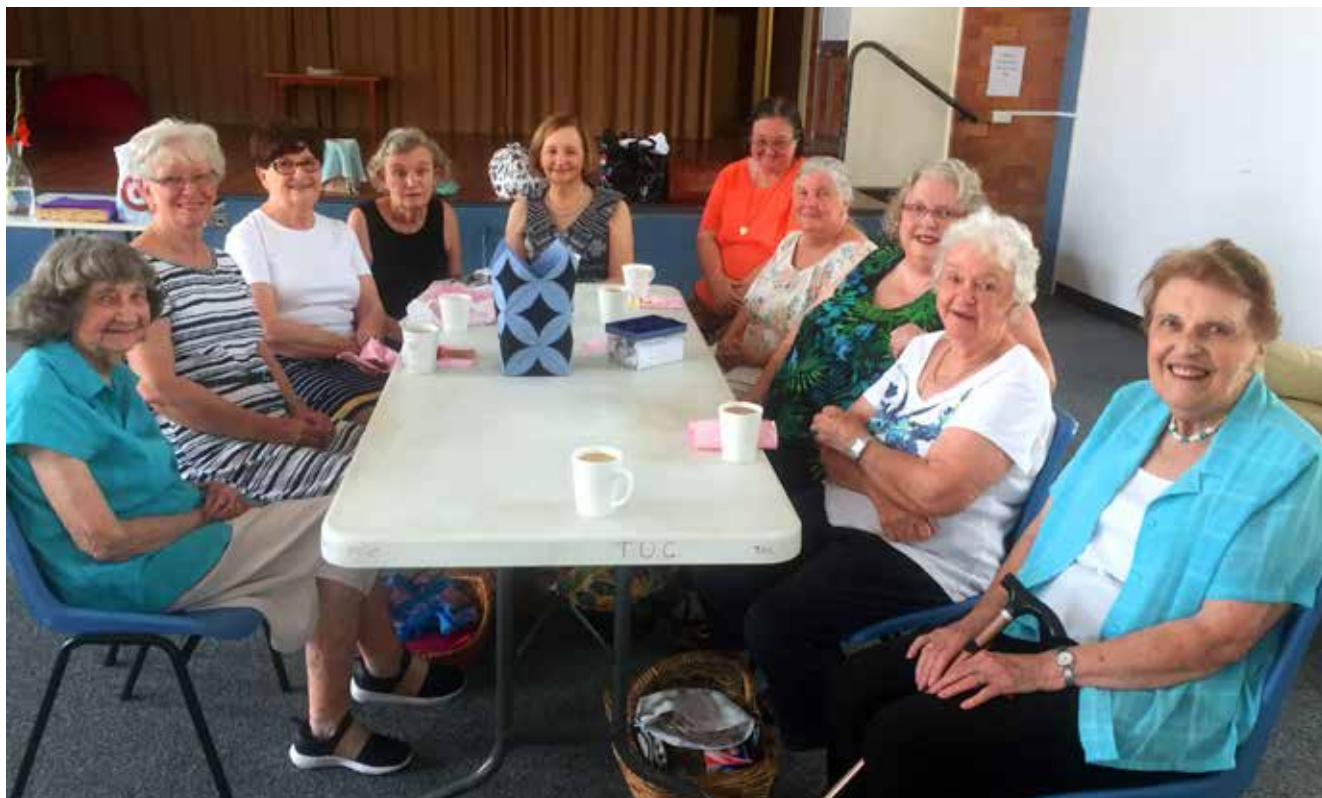
Some members of the Stitching & Friendship Group enjoying a cuppa before they get to work on their various craft projects. This photo is from late in 2019, but we are glad to see the group meeting again like this in early 2021!

Our Term commenced on 4 February 2020 and we managed to attend on 18 February, and on 3 and 17 March which was our last Craft Group meeting for the year due to COVID-19.