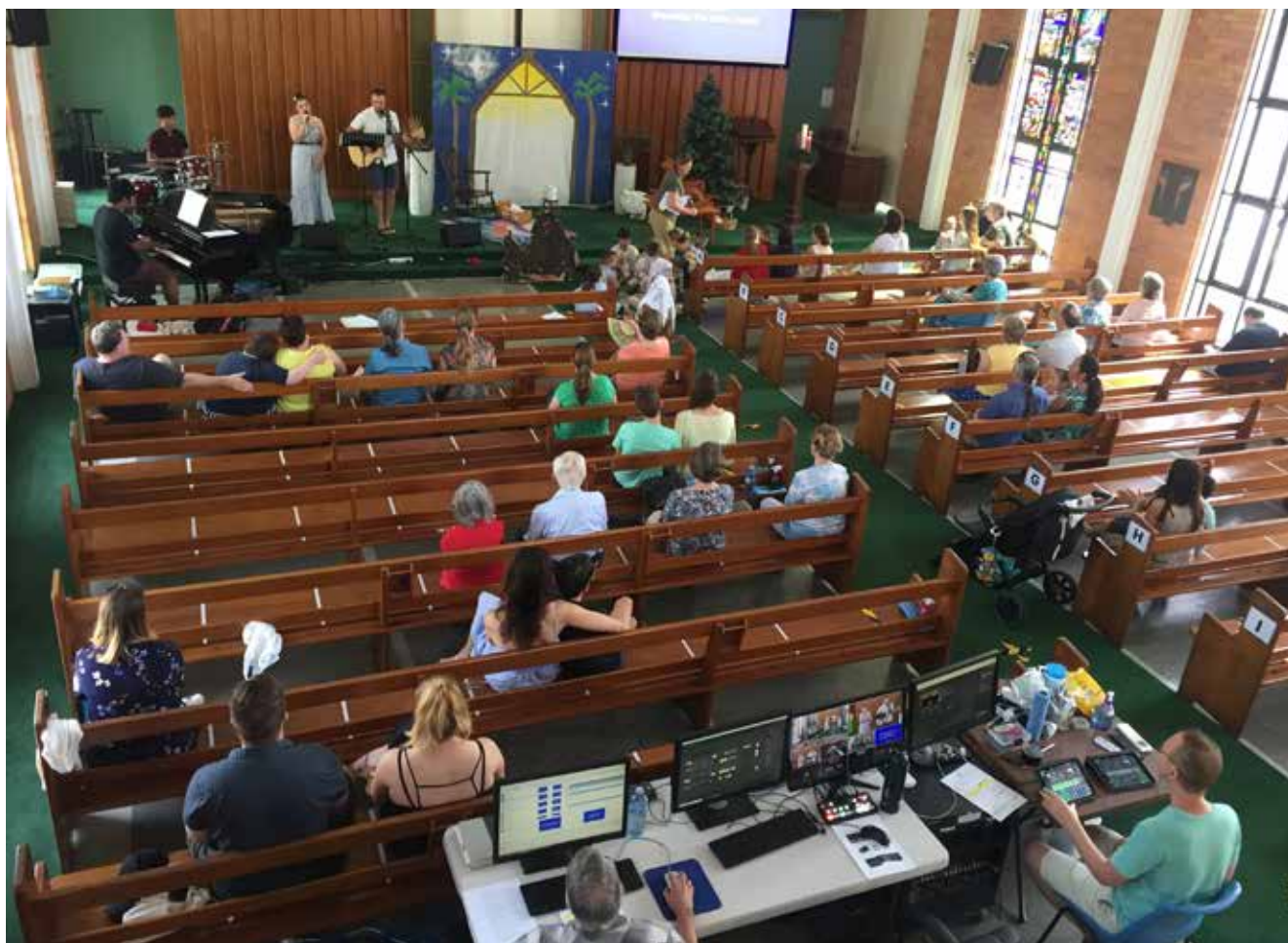
Our KATS Christmas Service on 6 December, 2020. We could still only have a limited number of people in the building at this stage with ticketed seats, but it was a great celebration with the kids leading us and performing their nativity!