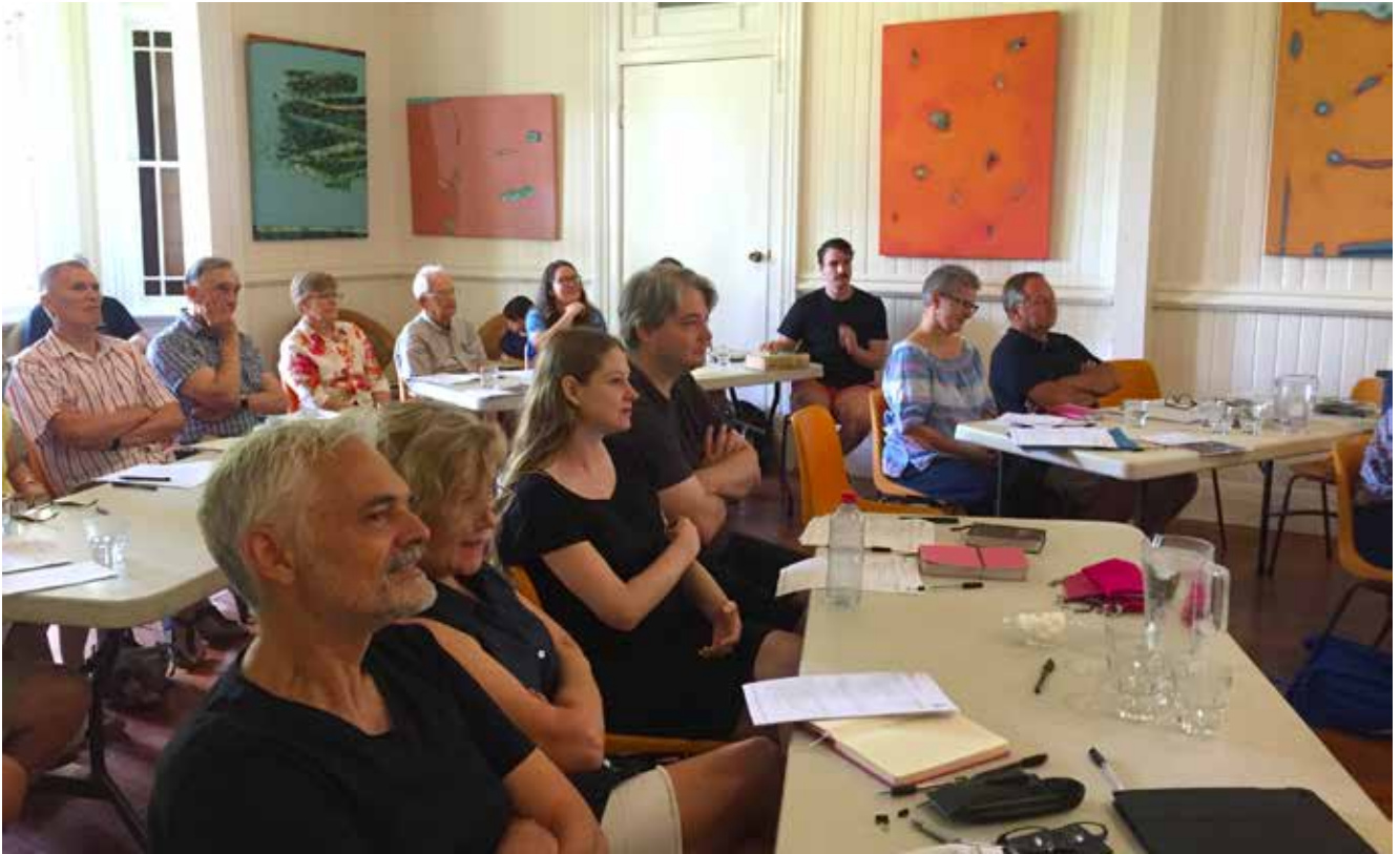
Our Vision & Planning Day in February, 2020.