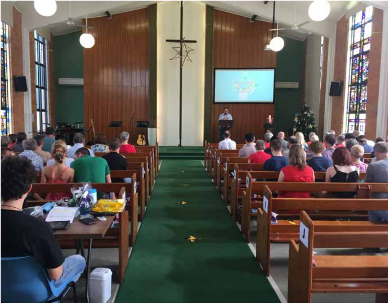
It was wonderful that we could all worship together in-person again for Christmas 2020.

streaming has increased our ability to engage people in any number of situations that would have previously been unreachable from Toowong.