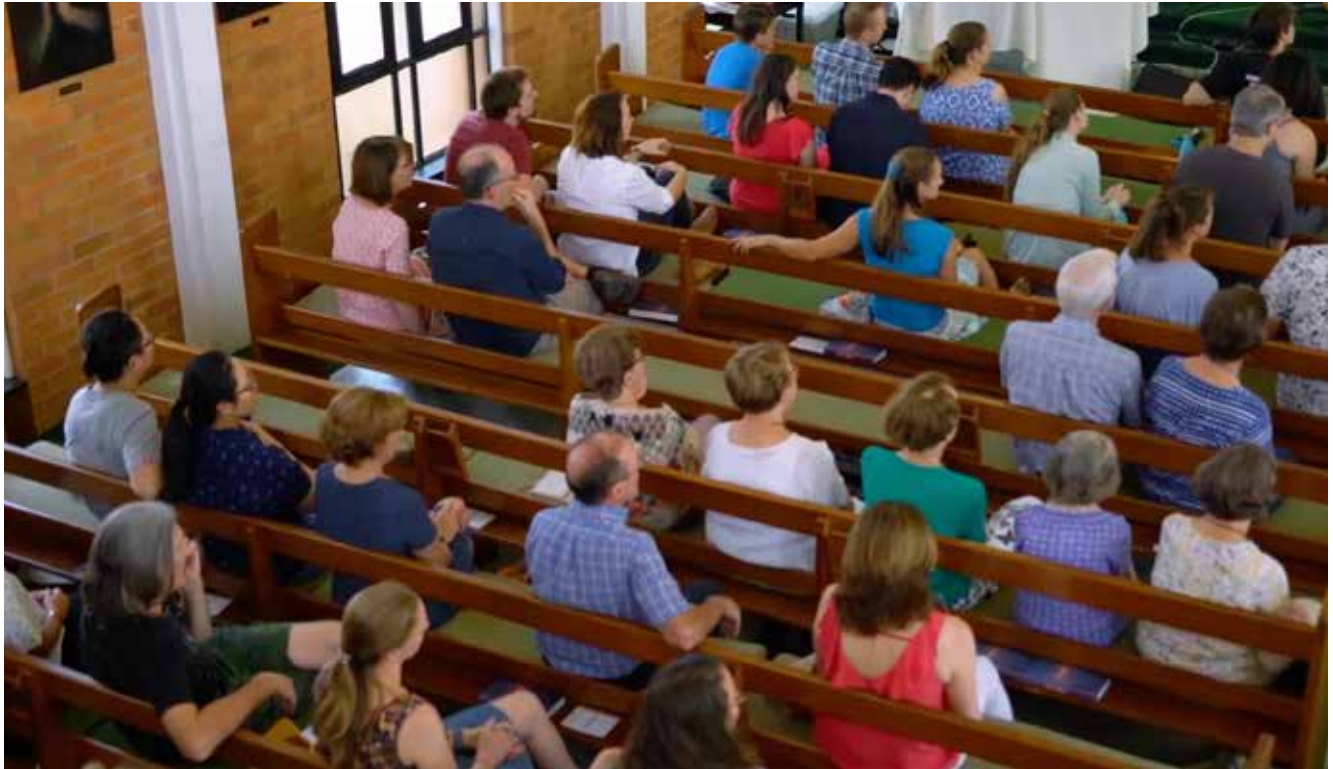
A photo of Sunday worship taken in early 2020 before the global pandemic.