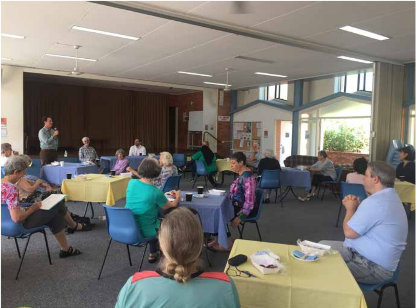
Our first COVID-Safe Morning Tea in 2020 on 21 October.