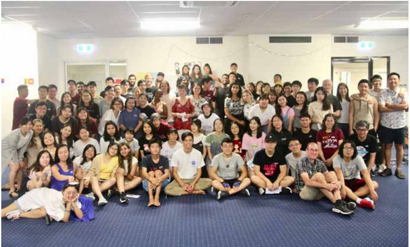
International Friendship Night, 2020.

Toowong Uniting Church has a strong partnership with Power to Change International Student Ministry (ISM). As the University Chaplain at TUC, my job is mainly to build the bridge between TUC and ISM by helping ISM to organize different international student activities and inviting students to come to TUC and know more about Jesus.